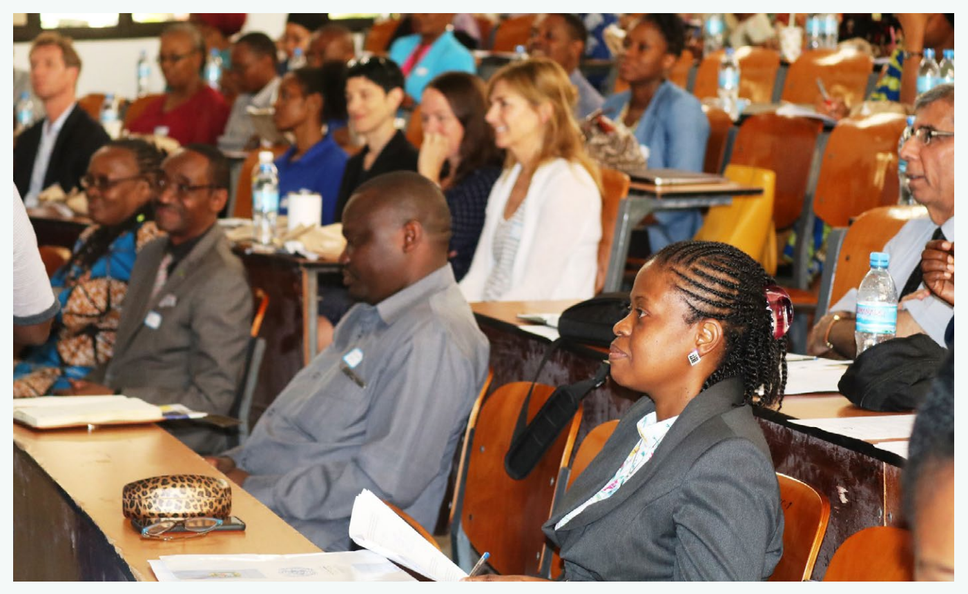
Participants of the 4th University wide Research Symposium following the Deputy Minister for Health's speech (not in picture).

organized with the Ministry of Health and attracted a number of government official, both at your ministry and the Prime Minister's office, Regional Administration and Local Government'.